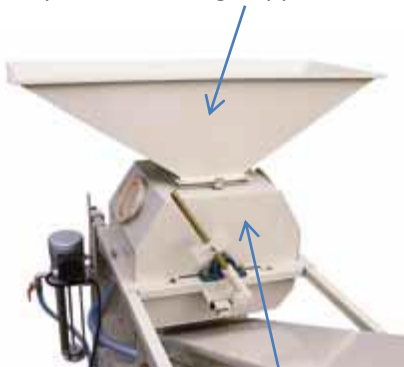
Adjustable tipping and weighing box,

Options: Feeding hopper with shorter height, throughout with 2 ways valves and container