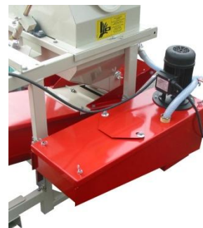
Tank with electric pump